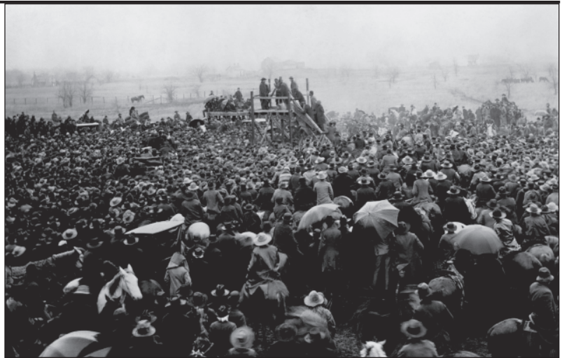
Lynching of a black man accused of murder in Paris, Texas, in 1893. The exceedingly large crowd shows this is a “spectacle lynching.”

One important result of her lectures in Britain was the formation of the British Anti-Lynching Committee. Members wrote letters to southern governors and other politicians, pressing them to enact anti-lynching laws or face losing British bank loans and investments. Some southern states did pass such laws, but their enforcement was often weak.