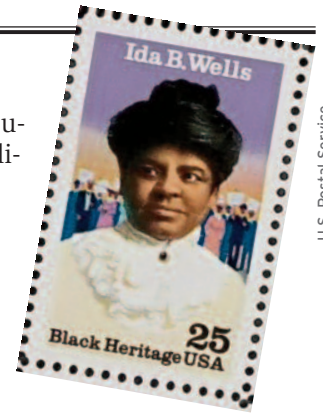
U.S. Postal Service

Congress never passed an anti-lynching law, although some states did. Between 1880 and 1930 there were over 3,000 lynchings in the U.S. The peak occurred in 1892 then slowly declined. That was the same year Wells launched her anti-lynching campaign.