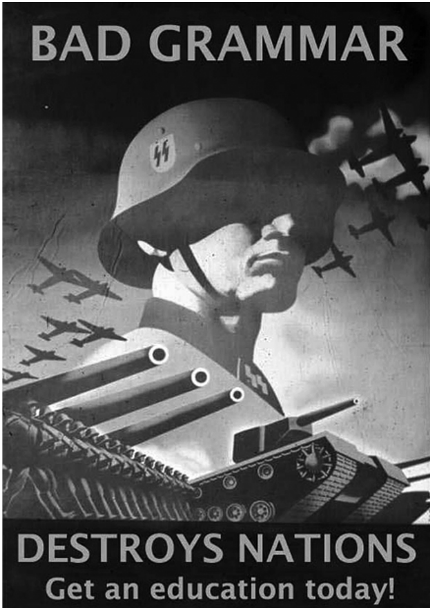
Figure 4.1 Bad grammar destroys nations

The idea of a standard language is constructed and re-constructed on an on-going basis by those who have a vested interest in the concept. At this juncture, it is necessary to consider in some detail exactly what this mythical beast called U.S. English is supposed to be.